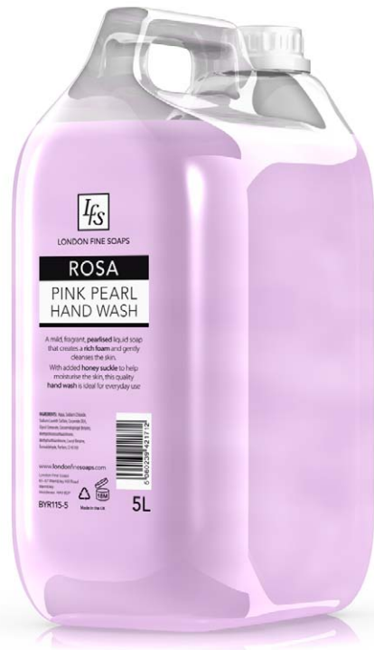
ROSA PINK PEARL HAND WASH

A mild, fragrant, pearlescent liquid soap that creates a rich foam. This fine hand wash has a subtle, honeysuckle fragrance which makes it perfect for everyday use.