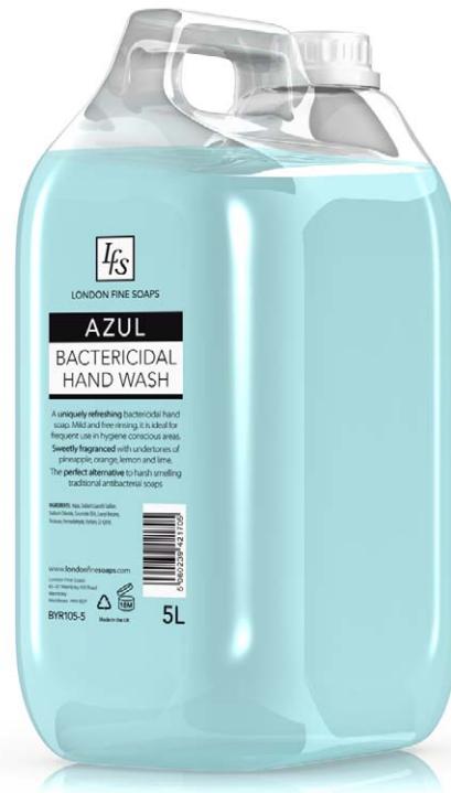
AZUL BACTERICIDAL HAND WASH

A mild, fragrant, pearlescent liquid soap that creates a rich foam. This fine hand wash has a subtle, honeysuckle fragrance which makes it perfect for everyday use.