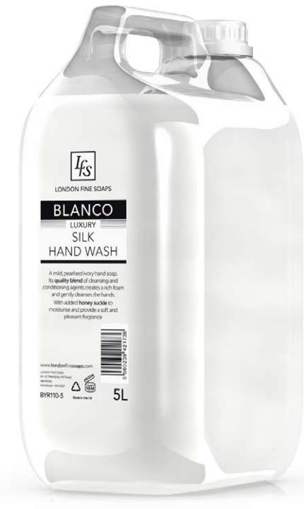
BLANCO LUXURY SILK HAND WASH

A mild, pearlescent ivory hand soap. Its blend of quality ingredients creates a rich, luxurious foam for effective yet gentle cleaning. Contains moisturising aloe vera to soothe the skin. The ideal match for either of our luxury moisturisers.